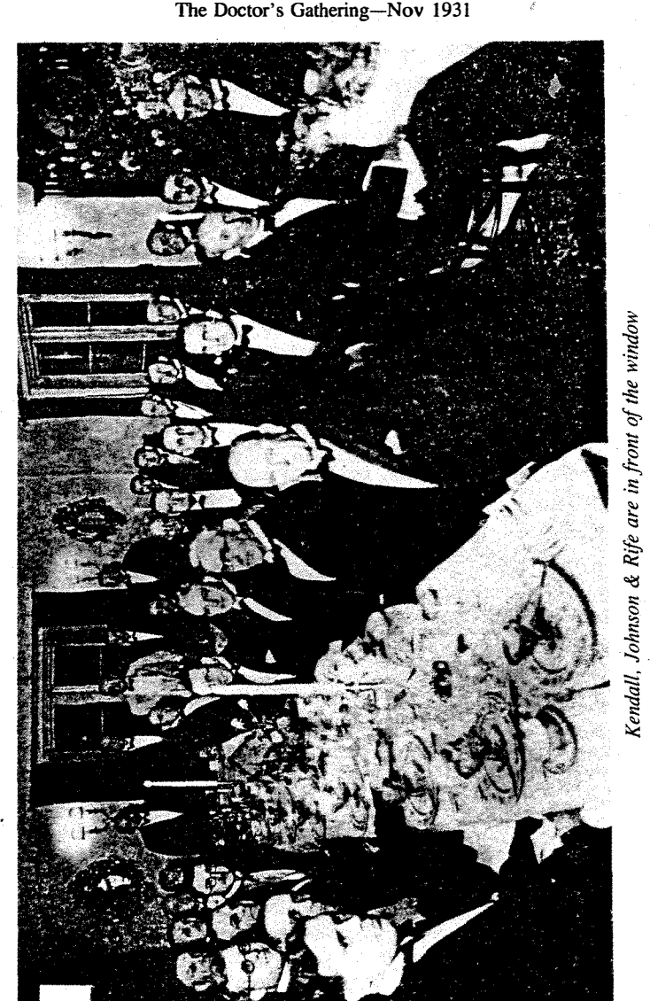
Appendix B The Doctor's Gathering-Nov 1931